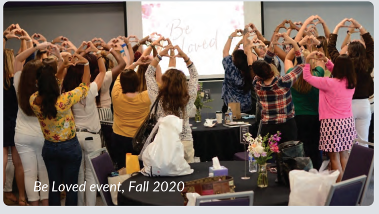
Be Loved event, Fall 2020