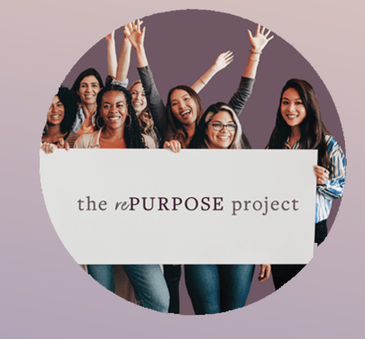
Donated designer purses fuel The rePURPOSE Project employment program.