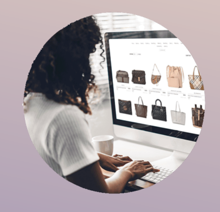
Survivors employed by One Purse run an e-commerce purse shop.