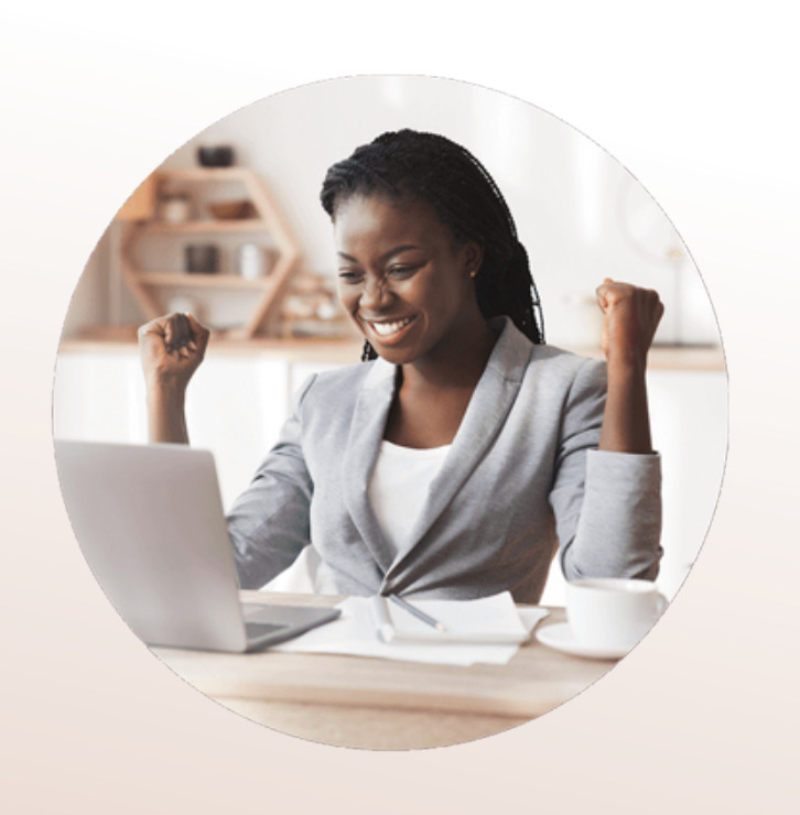
Employment & Education for survivors of Sex Trafficking

How a Pre-loved Designer Purse Empowers Survivors of Sex Trafficking