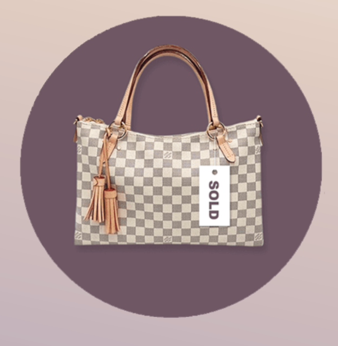
Revenue from purse sales is reinvested to provide more survivors with Employment and Education .